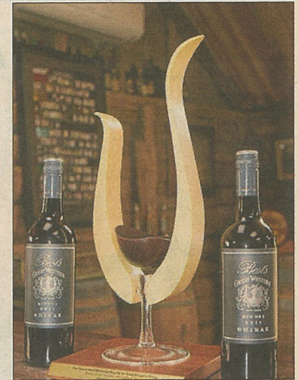
The Trevor Mast Trophy.